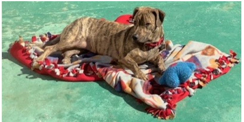
Mila (30 pounds)