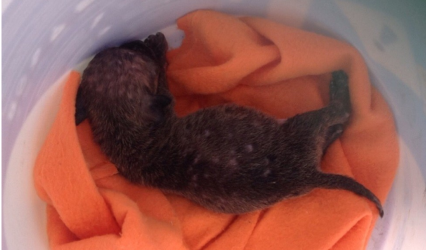
Mila at 5 weeks in a 5 gallon bucket

The pups are now over a year old and no longer puppies. They have grown into full size dogs. From underfed, starving skeletons they now weight between 30 and 65 pounds and love to take their caregivers for power walks.