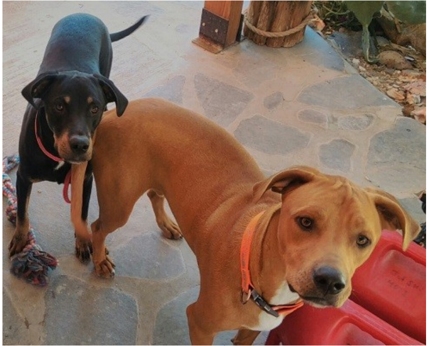
Poncho and Buddha